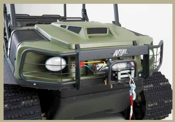
Halogen headlights, optional brushguard, 4,500 lb. (2,041 kg) power winch (optional) and skid plate for lower body protection.