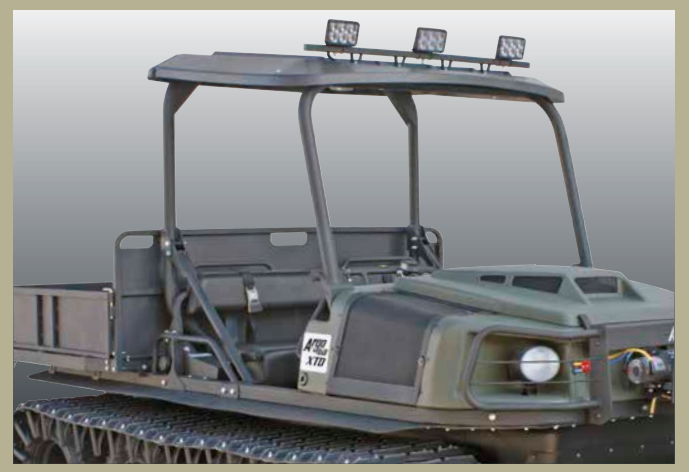
Optional, certified ROPS for two or four passengers is available with hard top for sun / rain protection and a light bar to add auxiliary lighting.