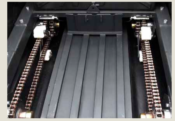
3" Tubular frame and reversible chain adjusters