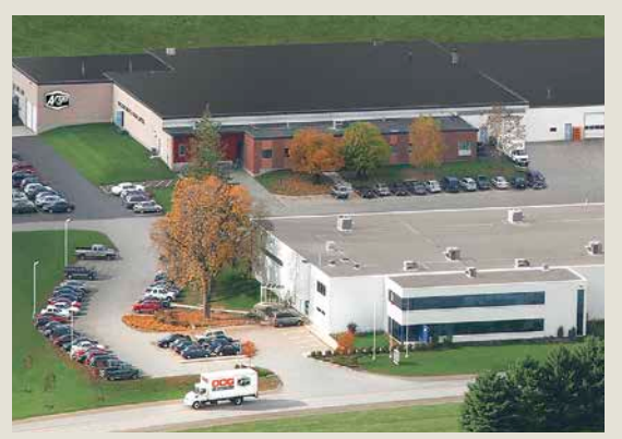
Where we proudly build the ARGO ...