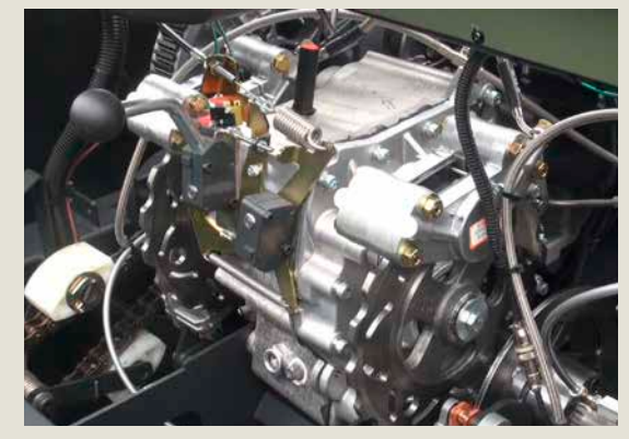
Direct drive ADMIRAL steering transmission

The all season capabilities of the ARGO XT models, in combination with a multi-purpose rear cargo platform, provide optimized utilization resulting in fast, year-round payback on investment. Proper operation and adherance to a scheduled maintenance program will ensure maximum uptime and usage for years to come.