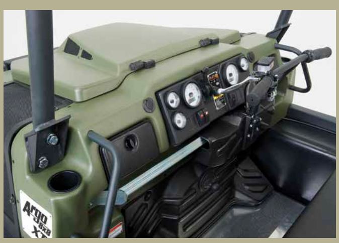
Multi-position steering system, instrumentation panel and convenience package (two cup holders, two storage compartments and two 12 volt outlets).