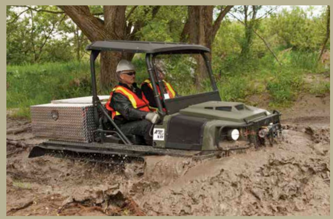
ARGO Utility Box protects and provides ample storage for equipment and tools.

All season ARGO 8x8 XT models are reliable partners in the toughest conditions imaginable, safely transporting your crew and gear to remote locations not accessible by traditional vehicles.