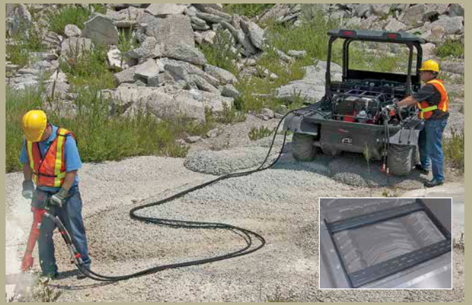
Hydraulic power pack made by Chicago Pneumatic. Installation with quick connect ARGO Universal Mounting System (Inset).