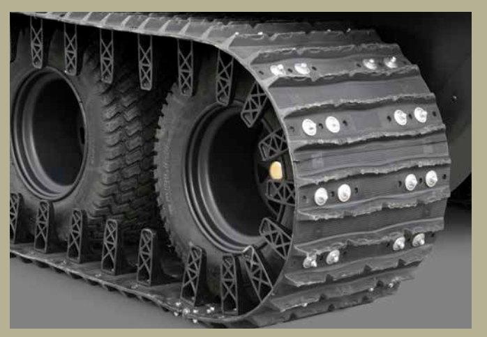
Optional 18" (457 mm) rubber tracks with heavy duty UHMW-PE guides on high impact resistant 24" (610 mm) tires and reinforced rims. www.argoutv.com/catalog/tracks