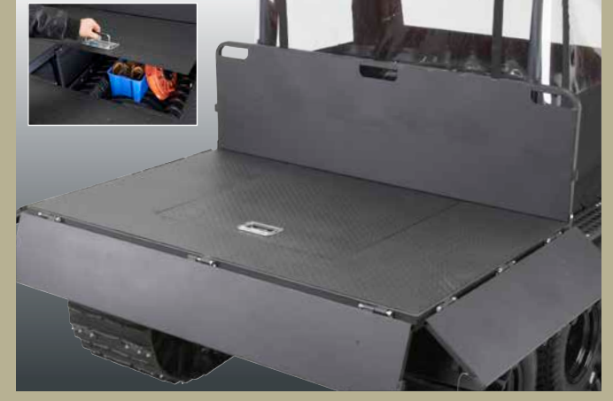
Optional, easily removable flatbed platform with access panel to storage area. Custom cargo configurations can be created by adding stakes, hinged or fixed side panels and tailgate.